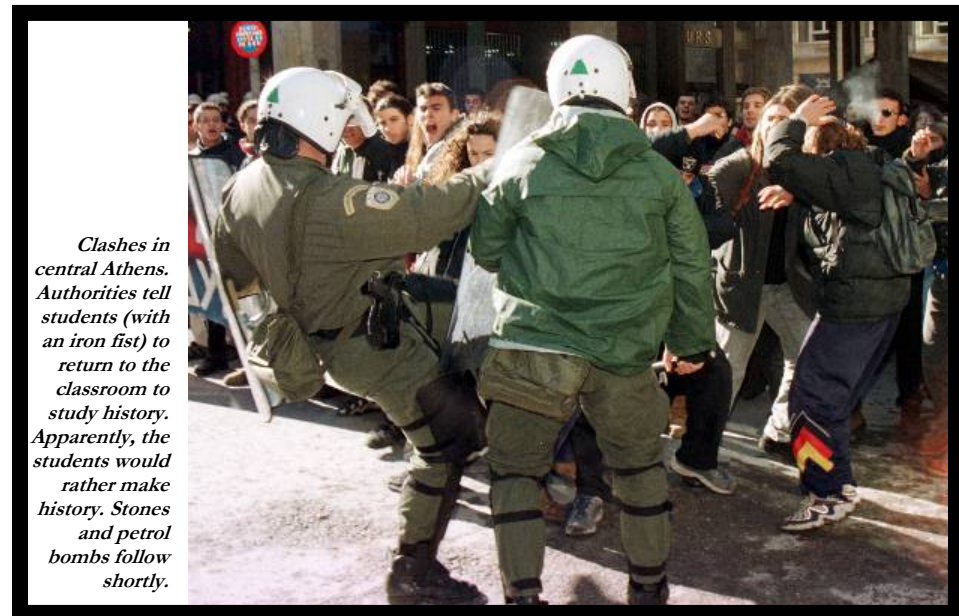
Clashes in central Athens. Authorities tell students (with an iron fist) to return to the classroom to study history. Apparently, the students would rather make history. Stones and petrol bombs follow shortly.

In August 1997, the educational law 2525 passed, introducing major reforms on all levels of education. As far as secondary education is concerned, all existing types of upper high schools get abolished and unified in one: the so-called "Unified Upper High School." Until now, the role of state upper high school has consisted in providing a 3-year attendance state certificate necessary for entrance to the university. It was just a preparatory stage, and indeed a slack one, since marks did not make any difference in university entrance: there were separate national exams in 4 subjects at the end of the 3 rd grade. The new law "upgrades" the status of the state school, introducing constant assessment of students through manifold exams, everyday tests (some of which pertain to students' behavior and personality), and a national certificate of studies with marks of all subjects of the 2 last grades determining the entrance to the university. National exams in 14 subjects in the end of the 2 nd and 3 rd grades correspondingly would, in turn, determine marks. Apart from the exams, new books were given based on a predominantly formalistic model, typically American in origin (i.e. multiple-choice questions, etc), making meaning hard to detect or vanish altogether.